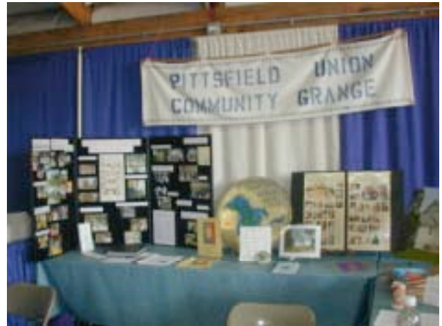
Grange booth at Saline Fair

2009 was the fourth year PUG participated in the Saline Fair, and each year we become more involved. For the first time, we donated prizes to Ladies' Day, and put Family Dance information into the hands of each family at Preschool Day on Thursday.