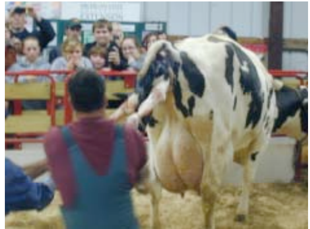
Veterinarian assisting as calf is born.

visits to the booth from several Grangers and a number of farming friends.