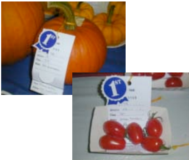
Mary's prizewinning vegetables at Chelsea