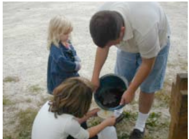
The finished product.