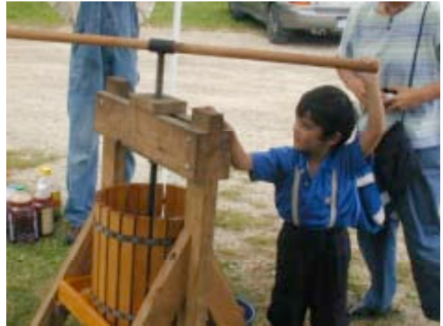
Tightening the press

Besides pressing cider, participants tasted a variety of fresh and dried apples, bought baked goods, helped make applesauce, sampled cider sorbet, and maybe even tried a family dance.